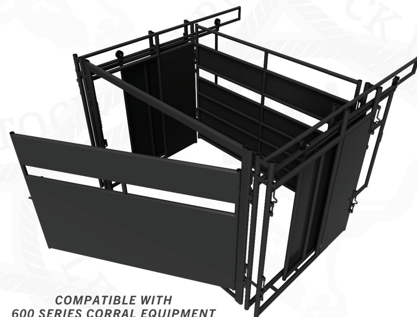
COMPATIBLE WITH 600 SERIES CORRAL EQUIPMENT

The 2W Bison Series Heavy Duty Equipment line is an ultra heavy-duty product utilizing high strength materials and advanced manufacturing processes. This product line provides unmatched durability and functionality for all large livestock handling applications. Sheeted steel is integral to the design which restricts bison's visibility throughout the system. This dissuades the animal from attempting to escape through the small visibility slots.